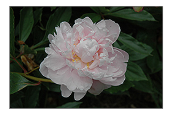
Pride of Essex Peony flowers