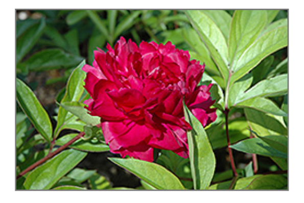
Philippe Rivoire Peony flowers