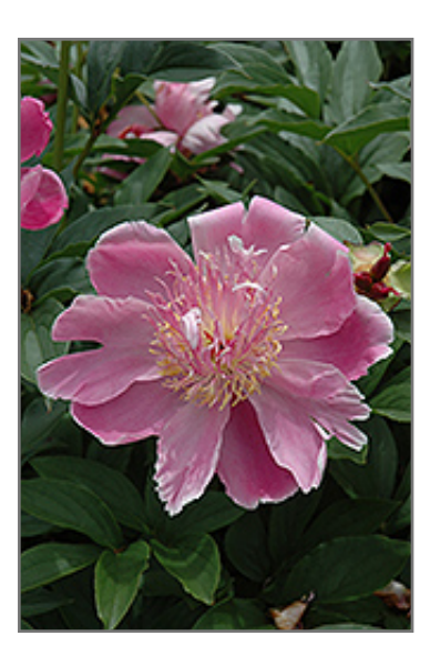
Petite Renee Peony flowers

Japanese form peony is a delicate lilac-pink; the large guard petals open to narrow, central pink petals mixed with red and yellow stamens for a unique effect