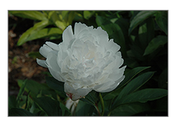
Nanette Peony flowers