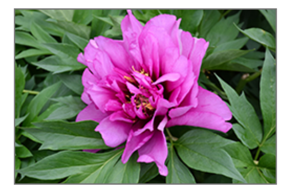
Morning Lilac Peony flowers

Morning Lilac Peony is recommended for the following landscape applications;