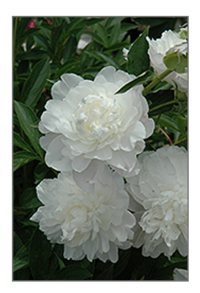
Moonstone Peony flowers