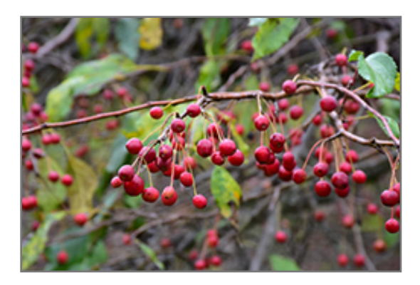
Red Jade Flowering Crab fruit

This is a high maintenance shrub that will require regular care and upkeep, and is best pruned in late winter once the threat of extreme cold has passed. It is a good choice for attracting birds to your yard. Gardeners should be aware of the following characteristic(s) that may warrant special consideration;