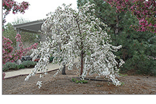
Red Jade Flowering Crab in bloom

A tremendously artistic ornamental shrub that's smothered in showy pinkish-white flowers in spring and colorful red fruit in fall, compact and gracefully pendulous habit of growth, can be trained for maximum effect; needs well-drained soil and full sun