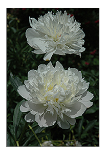
Madame Savreau Peony flowers