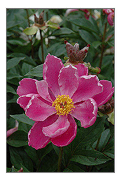
L'Etincelante Peony flowers