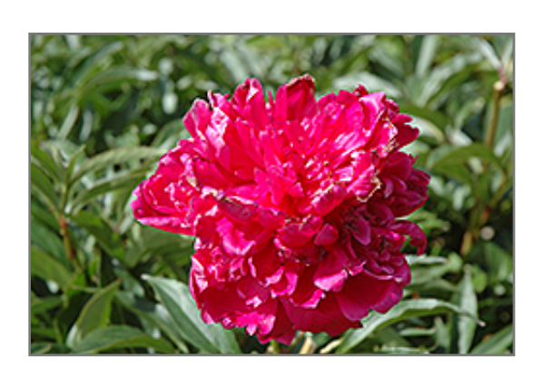
Laura Dexheimer Peony flowers