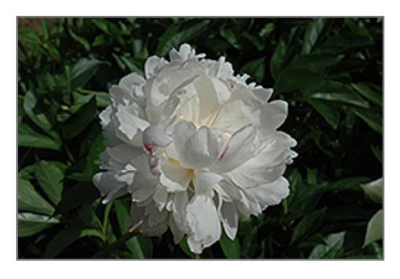
La Tulipe Peony flowers