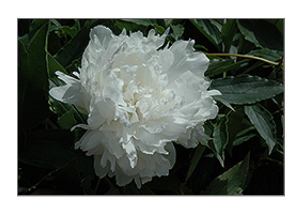
Jubilee Peony flowers