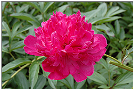
Felix Crousse Peony flowers