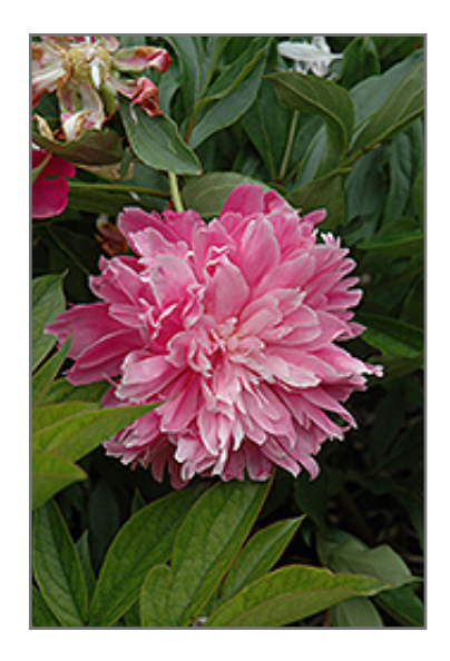
Faribault Peony flowers

Faribault Peony features bold fragrant double rose flowers with silver overtones at the ends of the stems from late spring to early summer. The flowers are excellent for cutting. Its compound leaves emerge burgundy in spring, turning green in colour throughout the season.