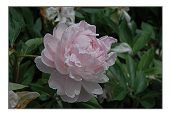
Edwin C. Shaw Peony flowers