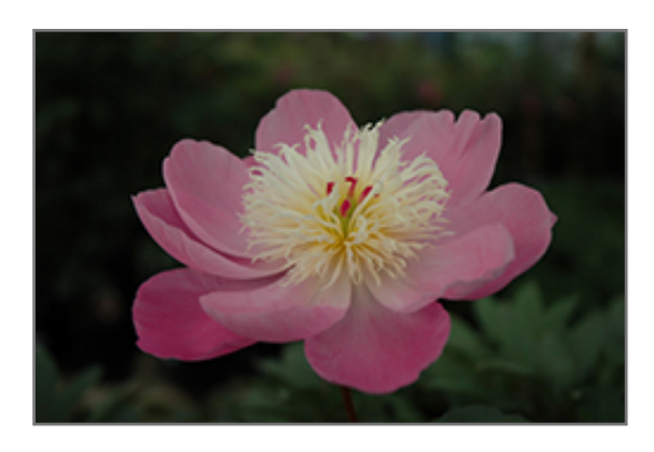
Edulis Superba Peony flowers