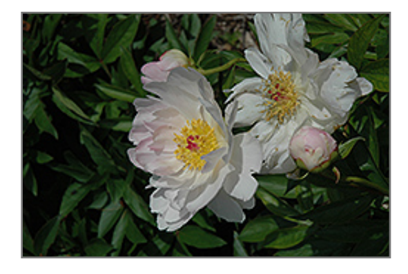
Early Daybreak Peony flowers