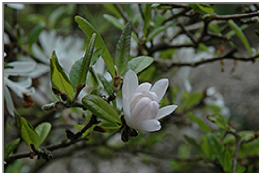
Pink Star Magnolia flowers