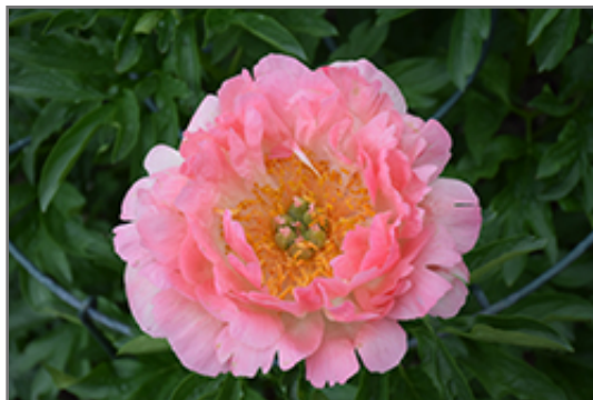
Coral Sunset Peony flowers (faded)