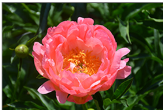
Coral Sunset Peony flowers