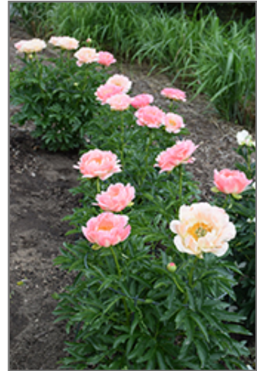
Coral Sunset Peony in bloom

This plant does best in full sun to partial shade. It does best in average to evenly moist conditions, but will not tolerate standing water. It is not particular as to soil pH, but grows best in rich soils. It is somewhat tolerant of urban pollution. This particular variety is an interspecific hybrid. It can be propagated by division; however, as a cultivated variety, be aware that it may be subject to certain restrictions or prohibitions on propagation.