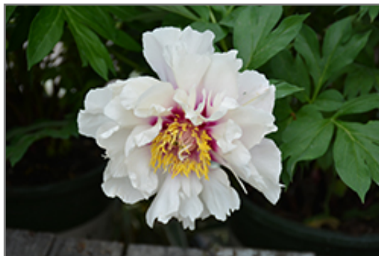
Cora Louise Peony flowers

A very pale pink, semi-double flower that's nearly white; deep purple flare around pronounced gold stamens; slight fragrance