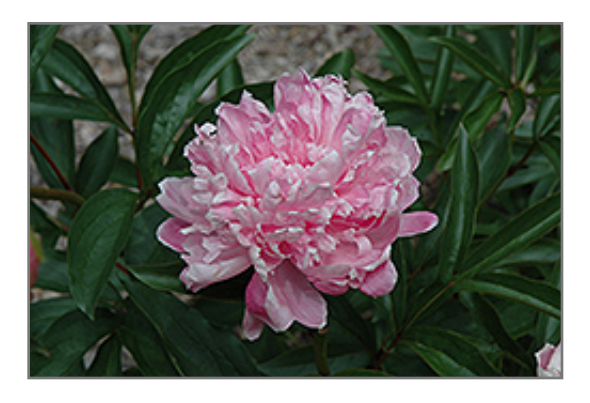
Clemenceau Peony flowers