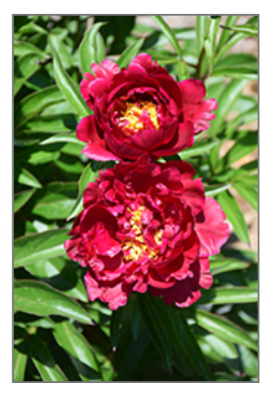
Cherry Hill Peony flowers

This is a relatively low maintenance plant, and should be cut back in late fall in preparation for winter. It is a good choice for attracting bees and butterflies to your yard, but is not particularly attractive to deer who tend to leave it alone in favor of tastier treats. Gardeners should be aware of the following characteristic(s) that may warrant special consideration;