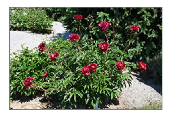
Cherry Hill Peony in bloom