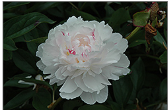
Bertrade Peony flowers