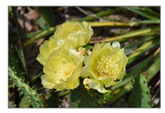
Prickly Pear Cactus flowers