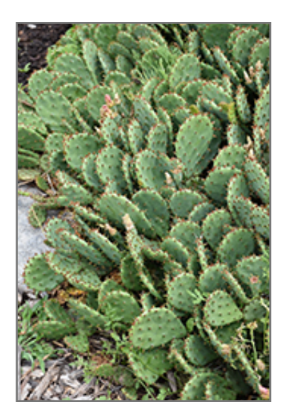
Prickly Pear Cactus

Prickly Pear Cactus is a small succulent evergreen plant with a spreading habit of growth that trails along the ground. As a type of cactus, it has no true foliage; the body of the plant is wholly comprised of a linked series of spiny light green pads which are connected together to form the branches of the plant.