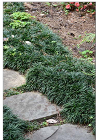
Dwarf Mondo Grass