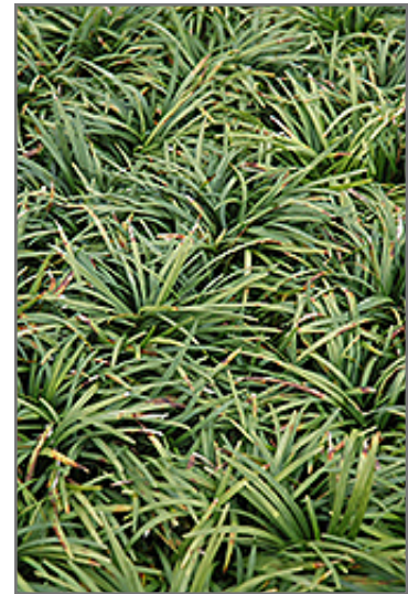
Dwarf Mondo Grass foliage

Dwarf Mondo Grass is recommended for the following landscape applications;