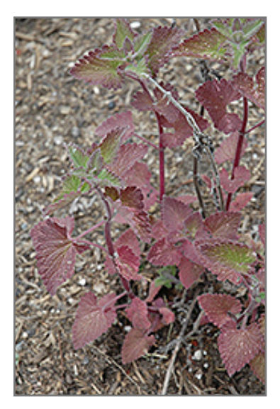
Catnip foliage