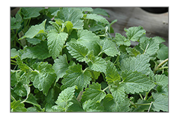
Catnip foliage