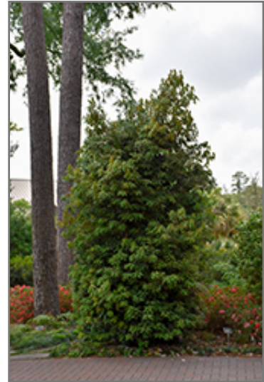
Buddhism Tree