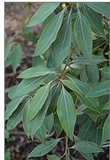
Buddhism Tree foliage