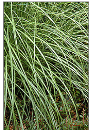
Little Kitten Dwarf Maiden Grass foliage