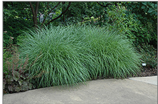
Little Kitten Dwarf Maiden Grass

Little Kitten Dwarf Maiden Grass is an herbaceous perennial grass with a mounded form. Its relatively fine texture sets it apart from other garden plants with less refined foliage.