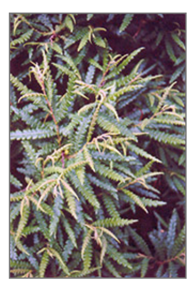
Sweetfern foliage