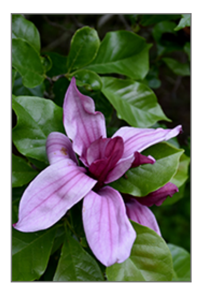
Nigra Lily Magnolia flowers

Nigra Lily Magnolia is recommended for the following landscape applications;