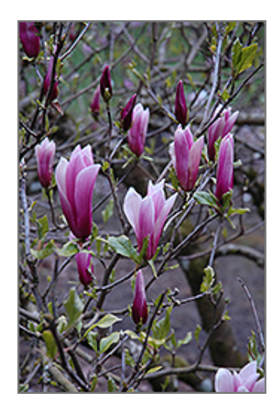
Nigra Lily Magnolia flowers