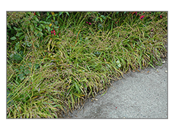
Golden Wood Rush foliage