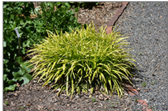
Pee Dee Gold Ingot Lily Turf