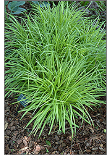
Pee Dee Gold Ingot Lily Turf

Pee Dee Gold Ingot Lily Turf is recommended for the following landscape applications;