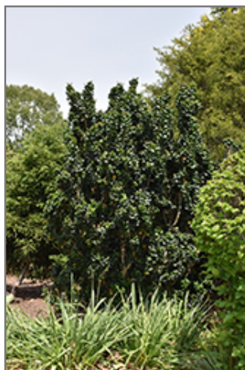
Dwarf Japanese Privet