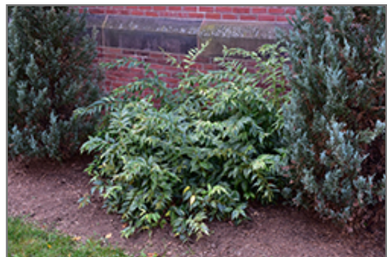
Rainbow Fetterbush