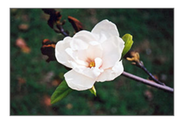
Purple Eye Magnolia flowers

A beautiful flowering accent tree for small home landscapes, features showy fragrant white cup-shaped flowers tinged purple in early spring; relatively coarse leaves and a neat upright habit of growth; flowers are occasionally lost to late spring frosts