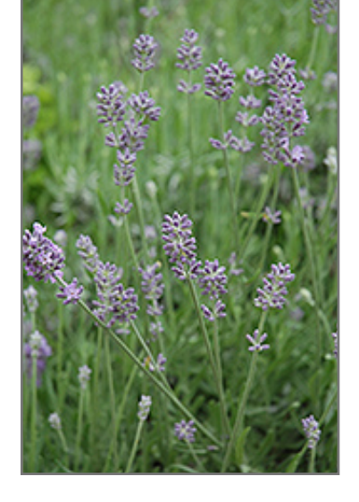
Baby Blue English Lavender flowers

A beautiful and aromatic flowering shrub covered with volumes of lavender-blue blooms through summer, excellent choice for low, informal hedging and in borders and formal gardens; plant near doors and walkways where the lovely scent can be appreciated