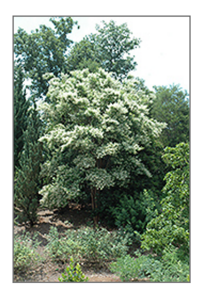
Kiowa Japanese Crapemyrtle in bloom