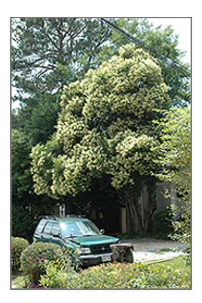
Fantasy Japanese Crapemyrtle in bloom