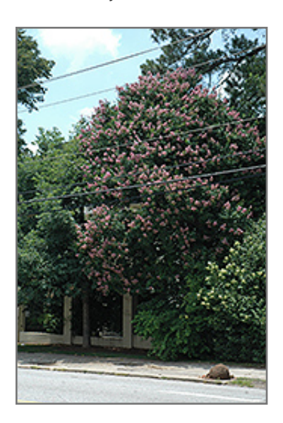
Biloxi Crapemyrtle in bloom