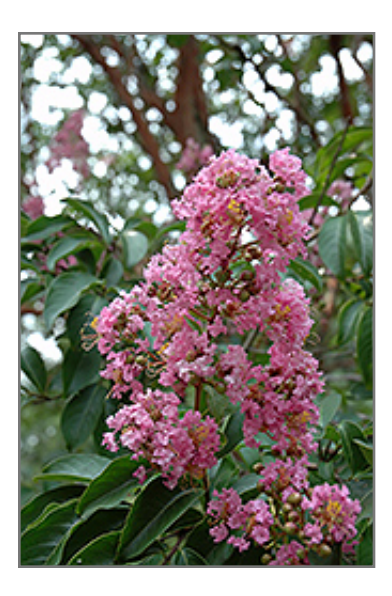
Biloxi Crapemyrtle flowers