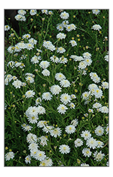
Double Japanese Aster in bloom

A distinguished low growing relative of the aster that is noted for its lanced shaped green leaves; forms a blanket of daisy-like double flowers with yellow centers, rising above the stems until frost