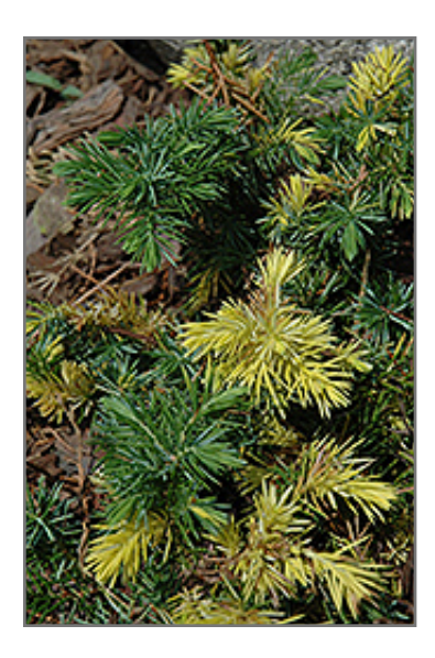
Sunsplash Shore Juniper foliage