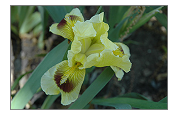
Ritz Iris flowers

Plant Height: 6 inches Flower Height: 8 inches Spread: 12 inches Spacing: 10 inches Sunlight: O O Hardiness Zone: 3a Group/Class: Dwarf