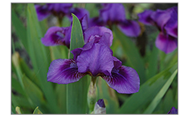
Novelette Iris flowers