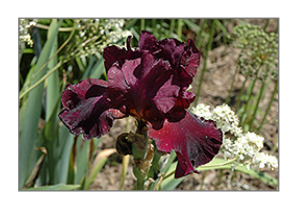
Mallory Kay Iris flowers