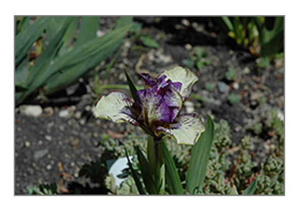
Kidling Iris flowers