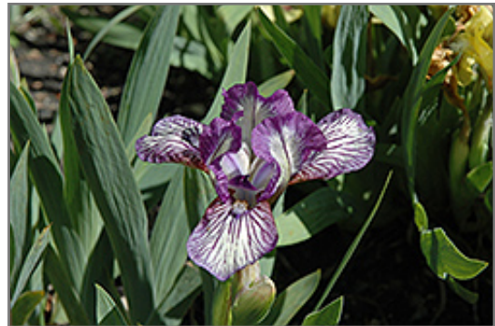
Flea Circus Iris flowers

Flea Circus Iris features showy purple flag-like flowers with white overtones and purple veins at the ends of the stems from mid spring to early summer. The flowers are excellent for cutting. Its attractive sword-like leaves remain bluish-green in colour throughout the season.