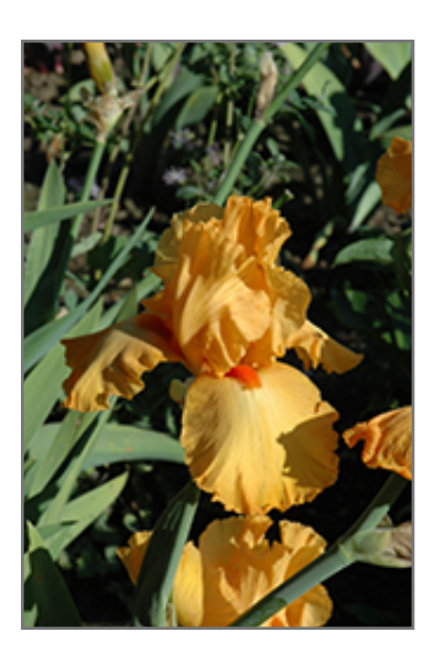
Avalon Sunset flowers