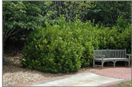
Yellow Anise Tree

This is a relatively low maintenance tree, and is best pruned in late winter once the threat of extreme cold has passed. It is a good choice for attracting birds to your yard, but is not particularly attractive to deer who tend to leave it alone in favor of tastier treats. It has no significant negative characteristics.