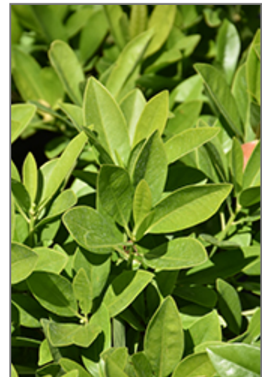
Yellow Anise Tree foliage