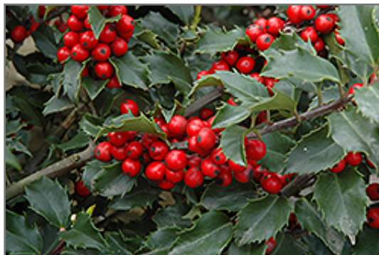
Berri-Magic Meserve Holly foliage