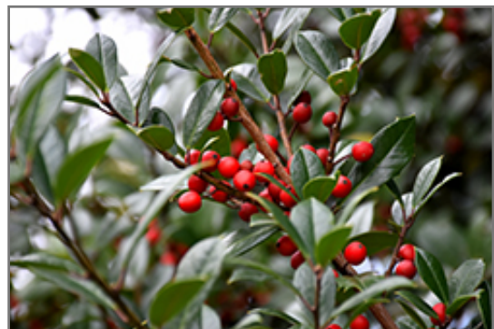
Foster No. 2 Holly fruit