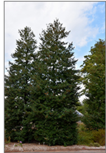
Foster No. 2 Holly fruit